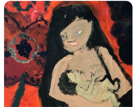
Page 6 – 2020 Myriad Art Exhibition Registrations Open