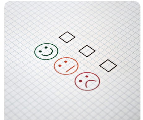
Page 4 – NDIS Review Recommends Changes