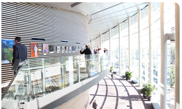
Myriad received a lot of exposure at the venue.