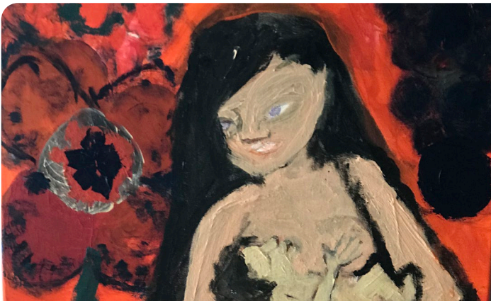
Painting by Mia Qua at Myriad 2019.

For information, visit cloust.com.au/events/myriad .